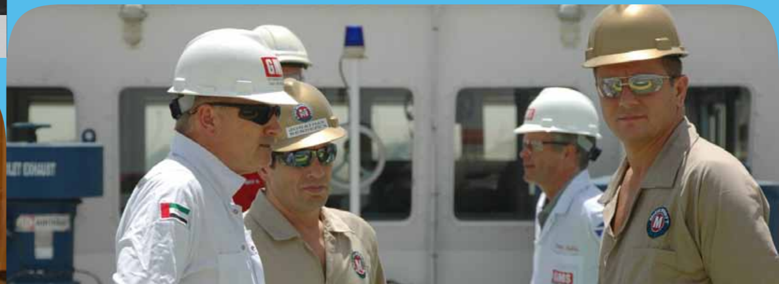
GMS hosted the visit of J Ray Mcdermott Middle East, Inc. to Barge Kudeta before mobilization to ADMA-OPCO oil fields for Water Injection Project.