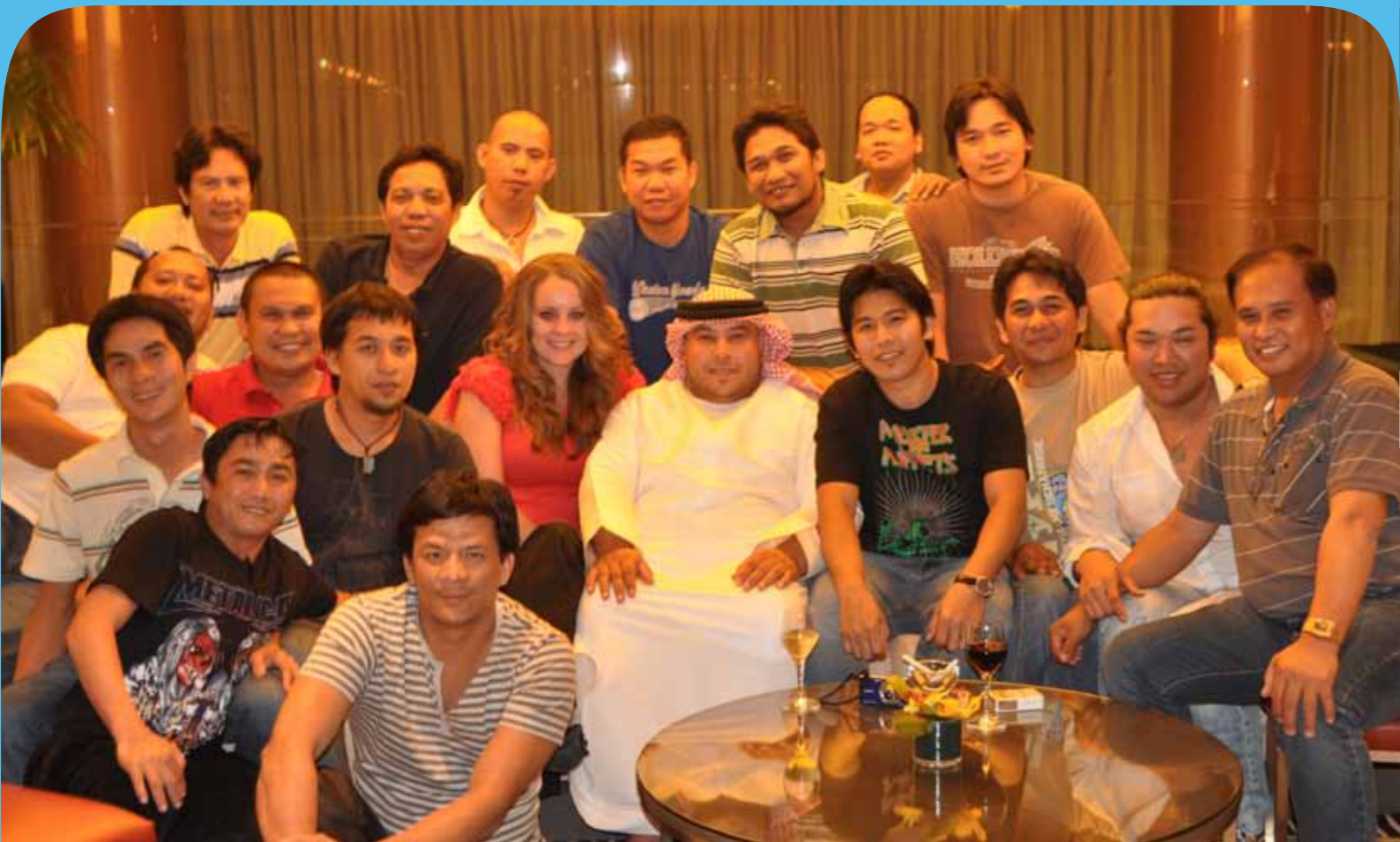
HSE GET TOGETHER FOR KELOA, KAWAWA AND KUDETA CREW AT ROTANA ARJAAN HOTEL.