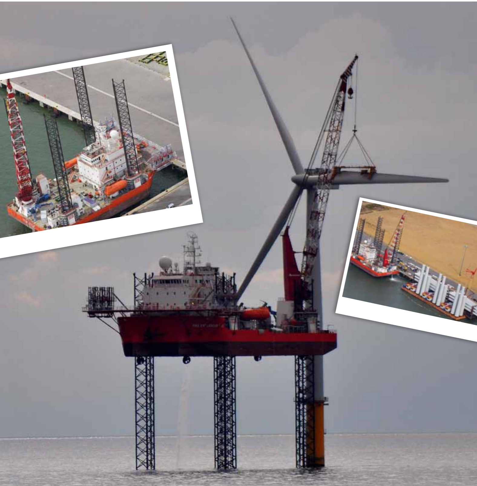
Wind Turbine Installation

At Different Positions in Great Yarmouth, United Kingdom for Wind Farm Project